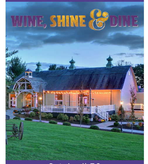
Sat April 30 A Fundraising Benefit for Zoellner Arts Center's Community Outreach Programs